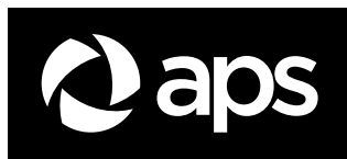
Reversed APS logo For use on a black or color background.